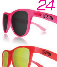
2 bright-eyed babes turn heads with a pair of Prime sunglasses by STUN. $20