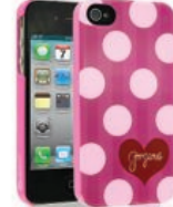
5 flirts are spotted with this Cellairis Gorgeous Heart Throb case for iPhone 4/4S. $25