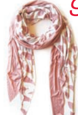
3 look heavenly in an Angel Blush scarf by Donni Charm. $90