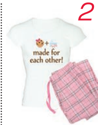
4 sleeping beauties score Cookie and Milk pajamas from CafePress. $45 (S-XXL)