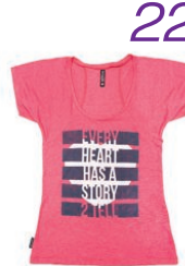
5 step it up with a Kathryn McCormick Story tee from Sugar and Bruno. $32 (XS-XL)