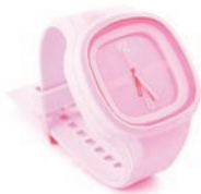
1 fashionista keeps time with this pink watch from RUBR Watch Nation. $25