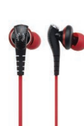
3 jazzy gals start groovin' with these Phiaton Moderna MS 200 earphones. $149

Well, we sure think so. Which is why we're beating Cupid to the punch. From crush-worthy cases to dazzlin' gems, there's loads of love to go around all February. Mwah! TO ENTER • Log on to girlslife.com • Look for the WIN TODAY box • Click on the prize and enter • Check the WINNERS' LIST each Friday • ENTER AS MANY TIMES AS YOU WANT! • U.S. residents only.