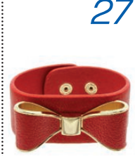
5 bow-lovin' babes wrap up February with this Minnie cuff from Lorraine Tyne. $25