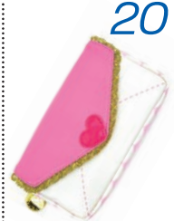
3 sharp sistahs win a Sealed with a Kiss pencil pouch from CoolPencilCase.com. $20