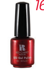
1 struts off with a Red Carpet Manicure Gel Polish Pro Kit and two polishes. $100