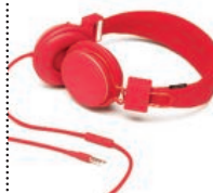
1 hip chick is all ears with a pair of Urbanears Plattan headphones. $60