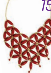
5 red-hot readers score this necklace from Le Mode Accessories. $25