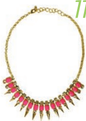
5 get to the point with this Pink Crystal Spikes necklace by Pree Brulee. $40