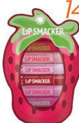
5 valentines are sweet on Lip Smacker Strawberry Lover's Lip Gloss Collection. $9