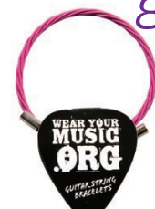
5 stars rock out with a Wear Your Music guitar string bracelet in Punk Pink. $10