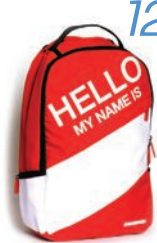
1 won't need an intro with this "Hello" red backpack from Sprayground. $50