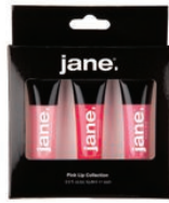
5 friendly femmes snag "The Friends of Jane" Lip Collection by Jane Cosmetics. $10