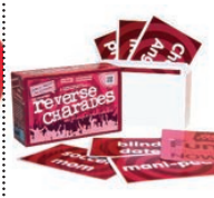
3 get sleepover-ready with this Girls' Night In Pack from Reverse Charades. $10