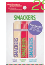
5 smell delight with this Smackers Sweet Fragrance Spray Collection. $10