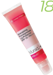
10 pucker up with Murad's Energizing Pomegranate Lip Protector SPF 15. $17