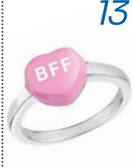
1 gets Sweethearts Jewelry's BFF Sweethearts rings for her and a bestie. $140