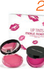
3 colorful cuties go for the bold with a Lip Tints gift set from Merle Norman. $20