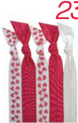
5 lovable ladies slip off with a Valentine's Day five-pack of hair ties by Emi-Jay. $13