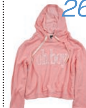
3 girls go boy crazy with this Cris hoodie from Boy Meets Girl. $55 (M)