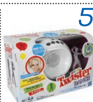
5 hot-to-trot hunnies hit the dance floor with Hasbro's latest hit, Twister Dance. $35