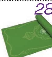
1 yogini finds her center with the ultimate beginner's yoga goody bag from Gaiam. $37