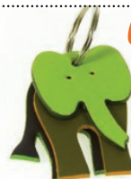
5 will never forget their house keys with this elephant key ring from MyWalit. $19