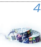
10 best buds show off their snaps with a custom bracelet from Wearshare. $7