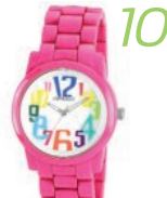
5 babes are fashionably on time with this hot pink watch from Sprout. $60