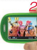
2 take their tunes on the road with eMatic's E6 Jr. 16GB MP3 player and camera. $50