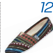
5 shoe-lovin' ladies get their kicks wearing Fojos' funky Anika mocs. $26 (5-10)