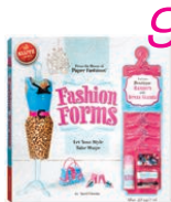
4 designers dream up fresh fashions with this collection of DIY books from Klutz. $70