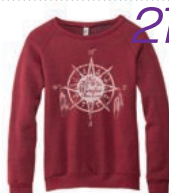
3 never lose their way in this Compass sweatshirt from Jawbreaking. $45 (XS-XL)