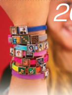
10 fangirls obsess over these custom band bracelets from ROXO. $35