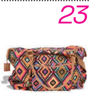
5 pack up their holiday loot in an Annalise duffel from Gia and Dani. $64