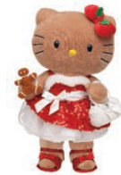
5 pounce on the season with a Gingerbread Hello Kitty from Build-A-Bear. $48

TO ENTER • Log on to girlslife.com • Look for the WIN TODAY box • Click on the prize and enter • Check the WINNERS' LIST each Friday • ENTER AS MANY TIMES AS YOU WANT! • U.S. residents only.