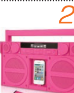
2 crank up the carols on iHome's iPA Portable FM Stereo Boombox. $200