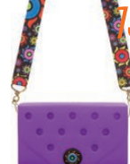
5 socialites hit the party circuit clutching Optari's new cross-body bag. $13