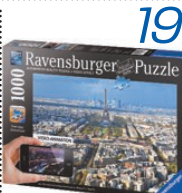
5 will always have Paris with this Ravensburger Augmented Reality Puzzle. $20