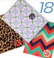
1 gadget-lovin' girlie grabs a personalized iPad case from Nico and Lala. $65