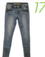
10 sparkle while wearing WallFlower Jeans' glitter dot skinny jeans. $50 (0-17)