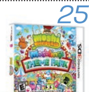
1 wins Mind Candy's Moshi Monsters: Moshlings Theme Park and a Nintendo 3DS. $300