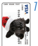
10 gals grab somethin' special with a $25 gift card from Gift CardLab.