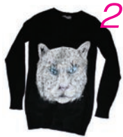
1 kitten is purrfect in this snow cat sweater from Angelika London. $200 (XS-XL)