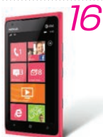
5 chatty chicas snatch up a Pink Lumia 900 cell phone for AT&T from Nokia. $50