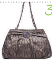
1 luxe lovely bags this Luxetimes purse from Paris Hilton Handbags. $180