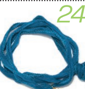
4 queens are totally charmed by this blue wrap bracelet from Abela Designs. $24