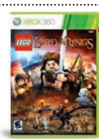
10 lord over LEGO's The Lord of the Rings video game. $50-$60 (Xbox 360 and Wii)