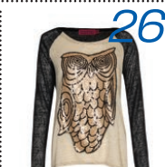
8 beauties snag trendy British togs with a $50 gift card to boohoo.com.