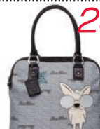
1 darlin' nabs this can't-believe-it's-so-cute bag from Paris Hilton Handbags. $150