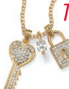
3 ladies lock down this 15k gold-plated necklace from overstock.com. $41