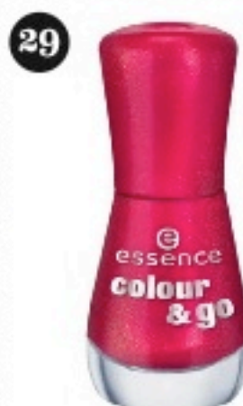
15 run off with a Colour & Go nail polish set from Essence Cosmetics. $9