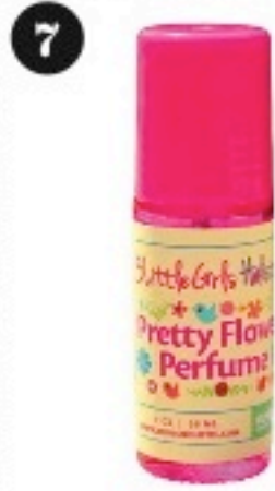
5 green girls grab organic perfume and lip balm from 3Girls Holistic. $16