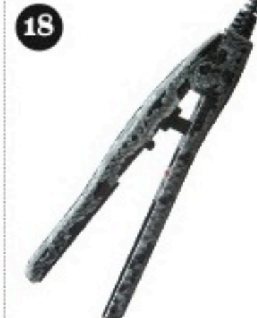
5 set things straight with a José Eber Petite Flat Iron in Snake Print. $50