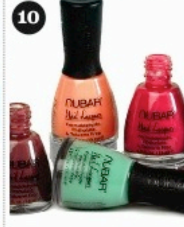
5 paint the town with the Spring in the City Nail Collection from Nubar. $65