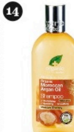
5 shine with a Moroccan Argan Oil hair care set from Organic Doctor. $45