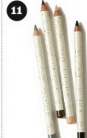
3 ladies line up for this vegan Eye Pencils set from Pacifica. $44