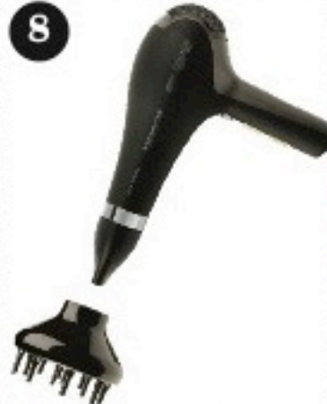
1 gets mega hair inspo with a Beauty Inspiration Pro Hair Dryer from Rowenta. $160