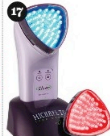
1 scores Michael Todd's True Organics Clear Bi Light Acne LED Treatment. $195