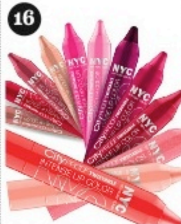
5 go big with NYC New York Color City Proof Twistable Intense Lip Color. $4