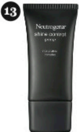
15 start smart with Shine Control Primer from Neutrogena. $14