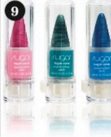
15 sistahs sweeten the deal with this eye shadow kit from Sugar. $35