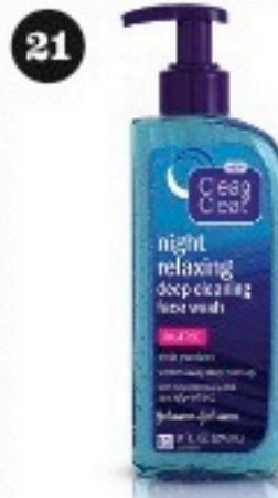
5 clean up with Clean & Clear's Night Relaxing face wash and wipes. $25