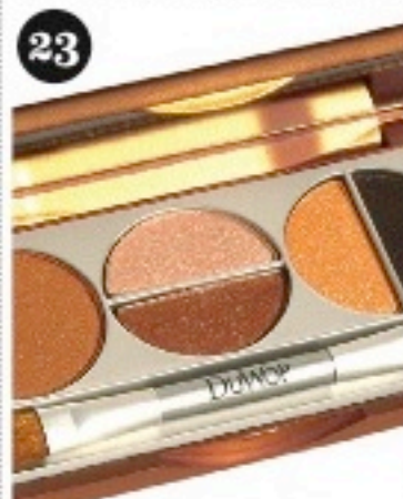
5 divas dazzle in DuWop's DuWop Eyes in Amber Eyes. $32