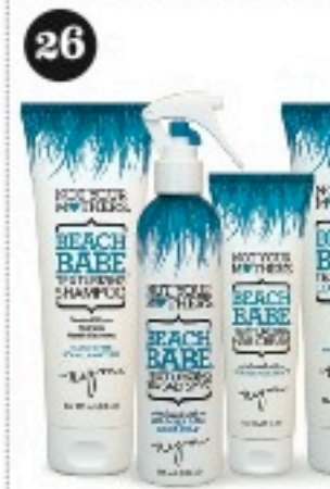
3 score a Beach Babe Texturizing Haircare Kit from Not Your Mother's. $24