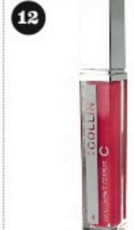
5 pump up their pouts with G.M. Collin Lip Plumping Complex in Rose. $34