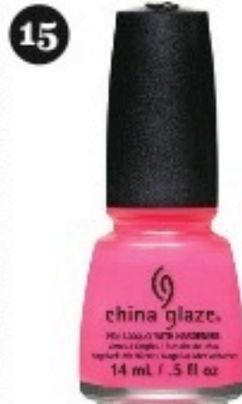
5 see the sights with the City Flourish Collection from China Glaze. $90