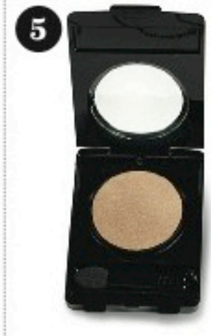
5 gals get gilded with Merle Norman Color Max Shadow in Goldigger. $12