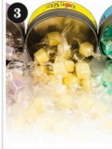
5 unwrap happy with BonBliss' Scrub-2-Go Tin in Mango Sorbet. $11