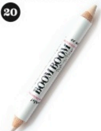
5 raise brows with a Boom Boom Push-Up Brow Highlighting Pencil. $18