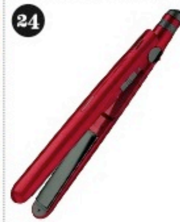
3 win an InfinitiPro by Conair 1" Double Titanium Ceramic Flat Iron. $50