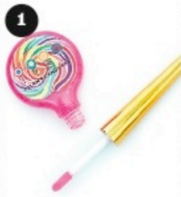
3 slick on Whirly Pop Lip Gloss from Dylan's Candy Bar's Candy Girl line. $7

TO ENTER • Go to girlslife.com • Look for the WIN TODAY box • Click on the prize and enter • ENTER AS MANY TIMES AS YOU WANT! • Check the winners' list every Friday • Open to U.S. residents only.