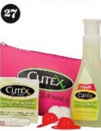
5 nail this season's looks with a Spring Mani Kit from Cutex Brands. $25