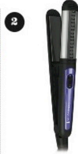
5 multitaskers 'do it all with a Remington Ultimate Styler 3-in-1 Styler. $30