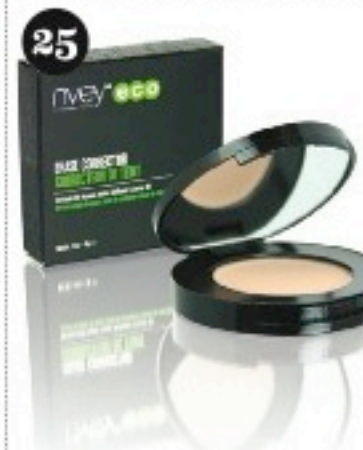
5 babes banish blemishes with Erase Concealer from Nvey Eco. $18