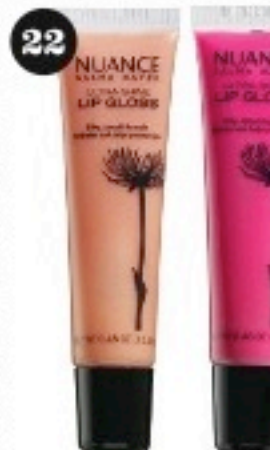
10 glow all out with a set of Nuance Salma Hayek Ultra Shine Lipgloss. $23