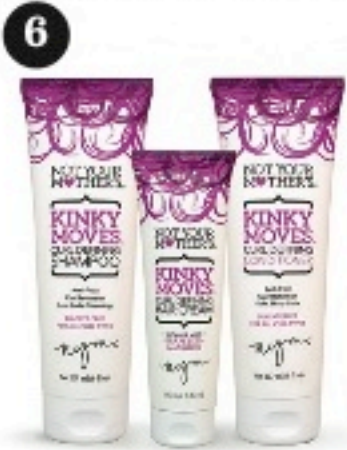
3 curls win a Kinky Moves Curly Haircare Kit from Not Your Mother's. $18