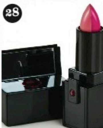
4 lovelies mouth off with a Lola Cosmetics lipstick set. $61