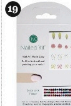
5 femmes frost their fingertips with a Cupcake Party Kit from Nailed Kit. $14